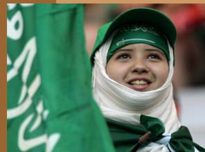
Saudi Arabia's 77th National Day, page 8