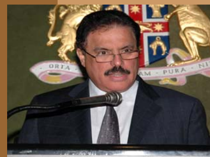
Secretary general of GCC visits Australia pages 2 and 3

The Parliamentarians also called on HRH Prince Al-Waleed Bin Tala of Kingdom Holding Company; HH Prince Saud Al-Thunayan, Chairman of the Royal Commission for Jubail and Yanbu; HH Prince Turki bin Mohammed, Under Secretary of the Ministry of Foreign Affairs; the Al-Mazraa