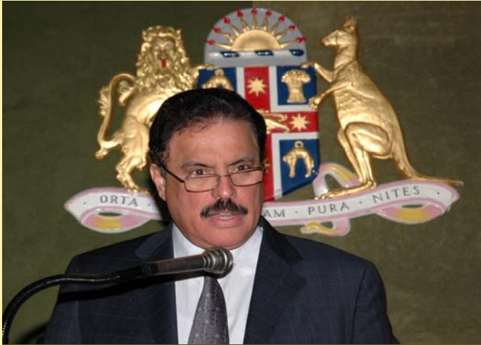
Secretary General of GCC delivers his speech at the Government House