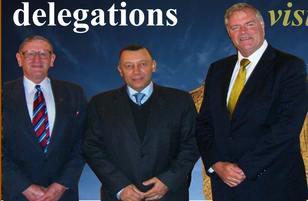
Hon Peter Slipper MP, Ambassador Hassan Nazer with the former Deputy Prime minister Kim Beazley

A n Australian Parliamentary delegation visited Saudi Arabia on 24 – 29 June as guests of the Majlis Al-Shoura. This was the first Australian parliamentary delegation since Saudi Arabia joined the Inter-Parliamentary Union and included three days in Riyadh and two days in the Eastern Province. The delegation consisted of four Members of the House of Representatives and one Senator and was headed by the Hon Peter Slipper MP, and included former Deputy Prime Minister the Hon Kim Beazley MP.